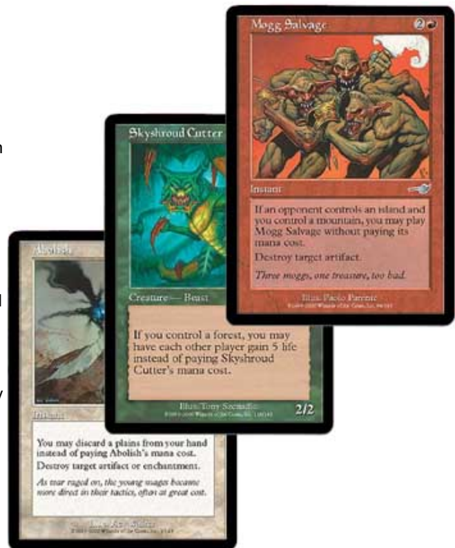
These three cards show different tweaks on the APC mechanic used in the Masques block."

Hopefully, my short jaunt through the mechanic will give you some insight into how many complex decisions go into making a card as elegant as Force of Will .